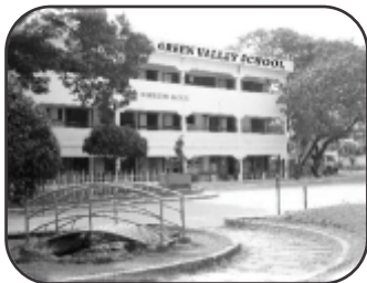
Green Valley Central School, Chennai