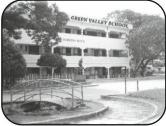
Green Valley Central School, Chennai